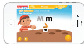
Mobile App for students & parents (For at-home review)