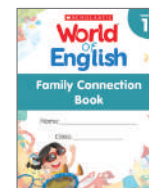
Family Connection Book (Supports school-to-home connection)