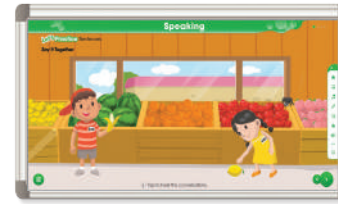
Instructional Software for class use