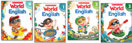
Activity Books (4 books per level)