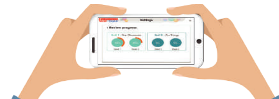
Mobile App for Teachers (For on-the-go review)