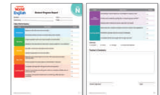
Student Progress Report (4 reports per level)