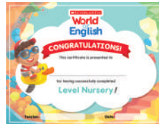
Certificate (For each level)