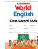
Class Record Book (1 book per level)