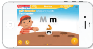
Mobile App for students & parents (for at-home review)